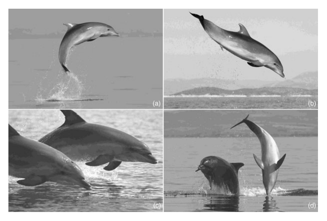
Fig. 1. These common bottlenose dolphins photographed in the eastern Ionian Sea show the characteristic morphology of the species: robust body, short beak, fading brown/grey coloration, white belly (occasionally pinkish), dorsal cape and flank stripes.